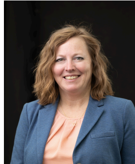
Mayor Maresa Manzione