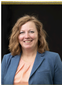
Mayor Maresa Manzione