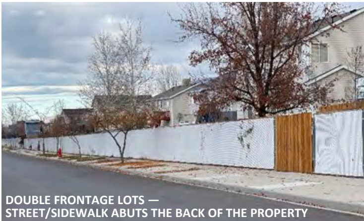
DOUBLE FRONTAGE LOTS — STREET/SIDEWALK ABUTS THE BACK OF THE PROPERTY