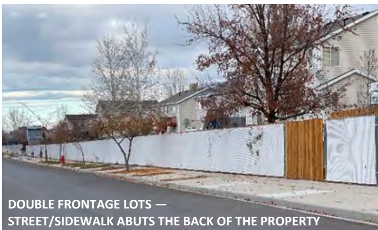
DOUBLE FRONTAGE LOTS — STREET/SIDEWALK ABUTS THE BACK OF THE PROPERTY