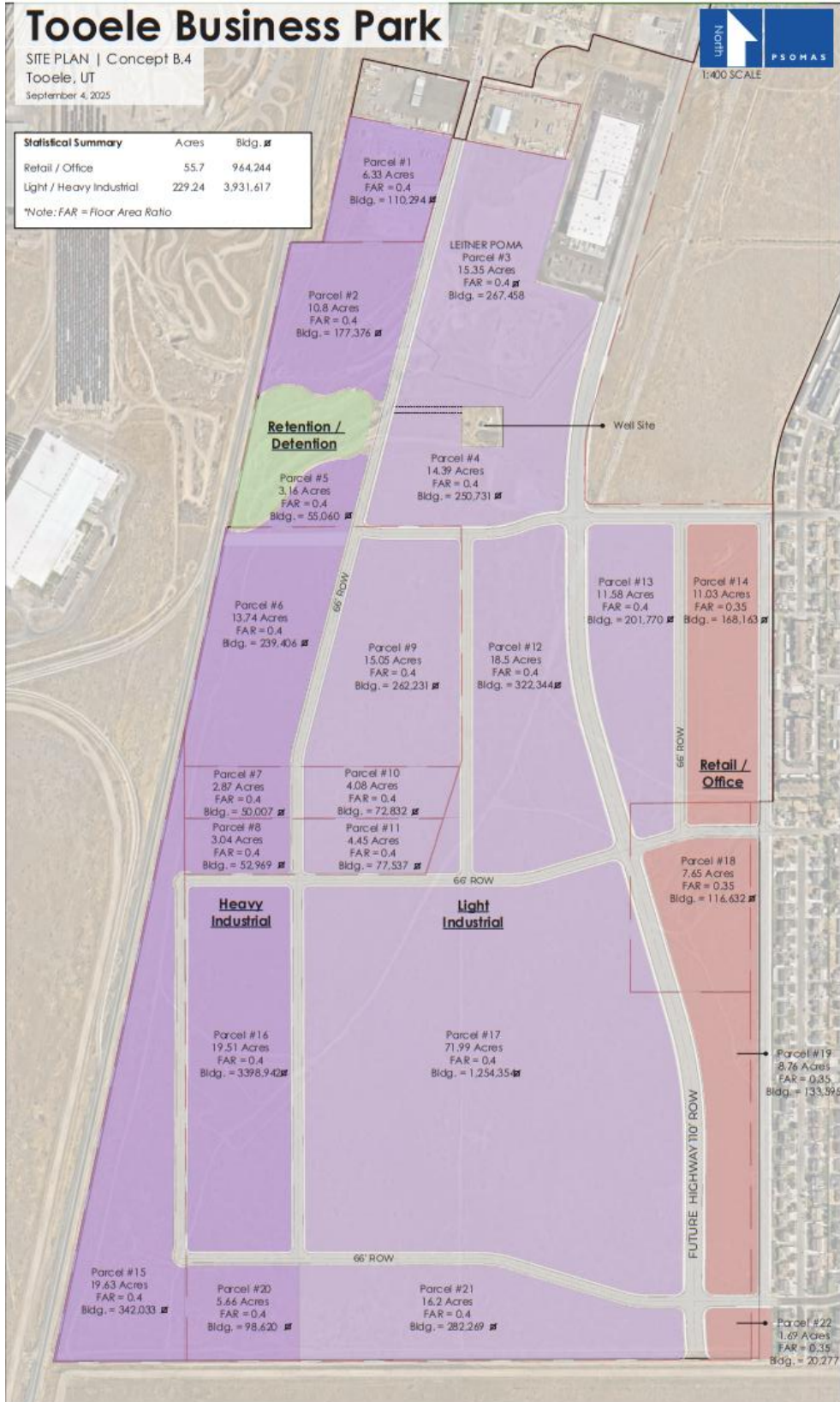
Figure 1. Zoning Map (Cont.)