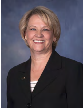
Mayor Debbie Winn

VISIT TOOELCITY.GOV FOR MORE INFORMATION